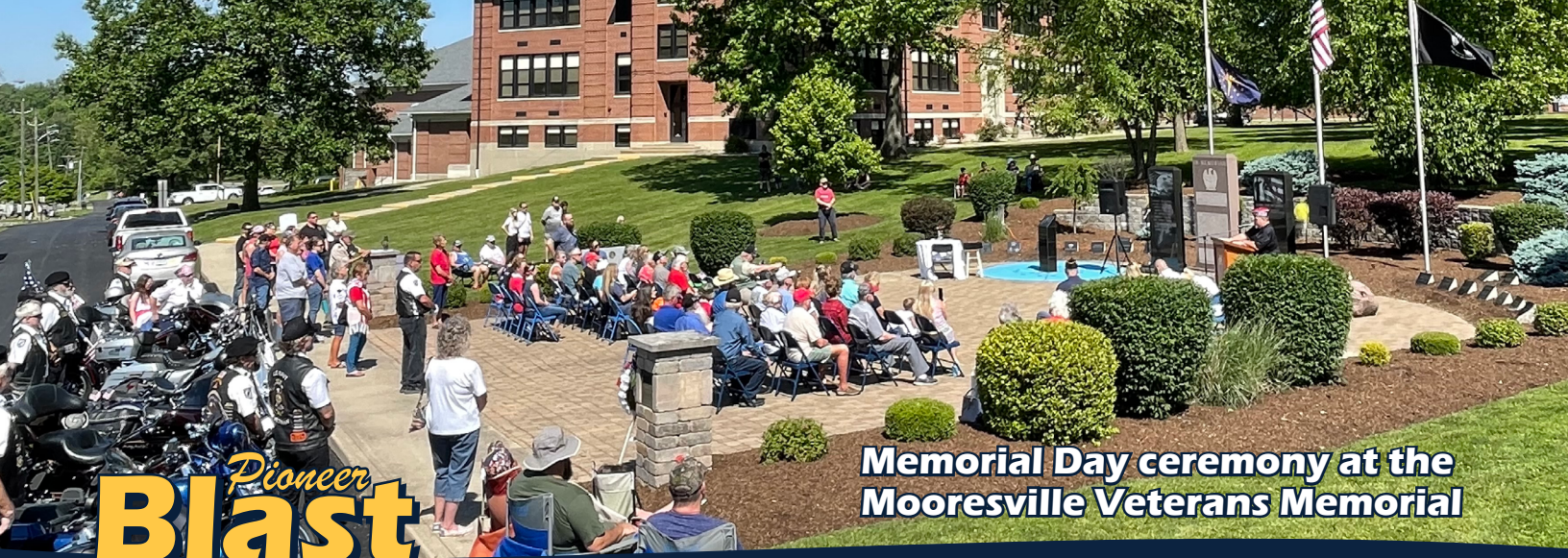
Memorial Day ceremony at the Mooresville Veterans Memorial